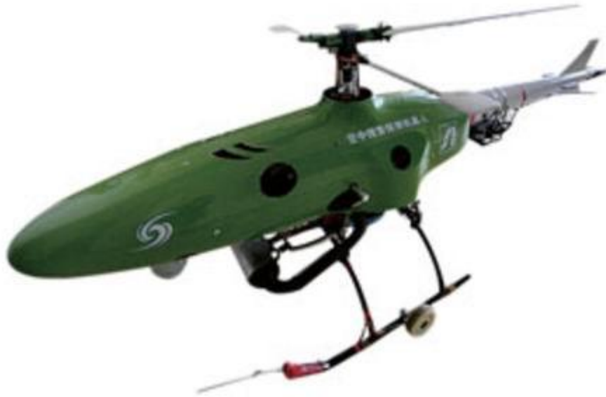
A robot plane.

A small robot plane, developed by the CAS Shenyang Institute of Automation, is the only robot that can fly in the sky. With a 3-meter wide wingspan and a 3-meter long body, the small robot plane is able to reach a flight speed up to 70 km/hour, allowing a super low level flight up to 10 meters above the ground. It can be readjusted for desired flying height and speed in line with the terrains. It consumes #93 gasoline, and can be employed to collect information on disasters. For example, it can feed the disaster relief authorities with the disaster information within the radius of a dozen kilometers.