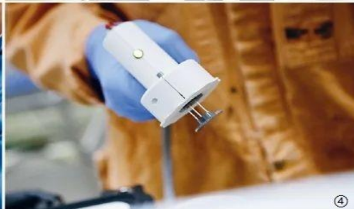
Photo 1: Chinese staff demonstrating the experimental process of the mRNA vaccine for the novel coronavirus. Photo 2: Israeli researcher working at the Migal 1 Galilee Institute in northern Israel. Photo 3: Researcher at the University of Pittsburgh, USA, conducting research on the novel coronavirus vaccine. Photo 4: Scientists at CSIRO, Australia's national science agency, conducting pre-clinical trials of the vaccine candidates for the novel coronavirus.